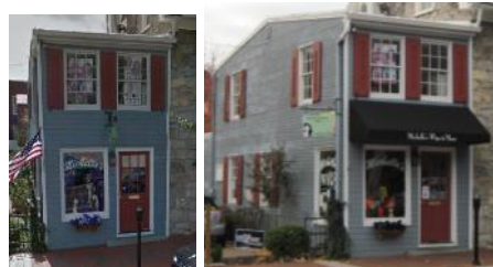
Michelle's Wigs & More 33 W. Piccadilly Street

There are few more still in progress... we will see them in next month's newsletter!