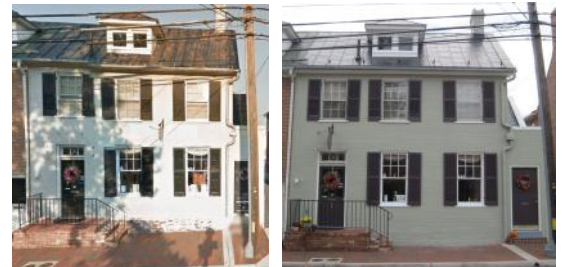
Nourish - 20 S. Braddock Street